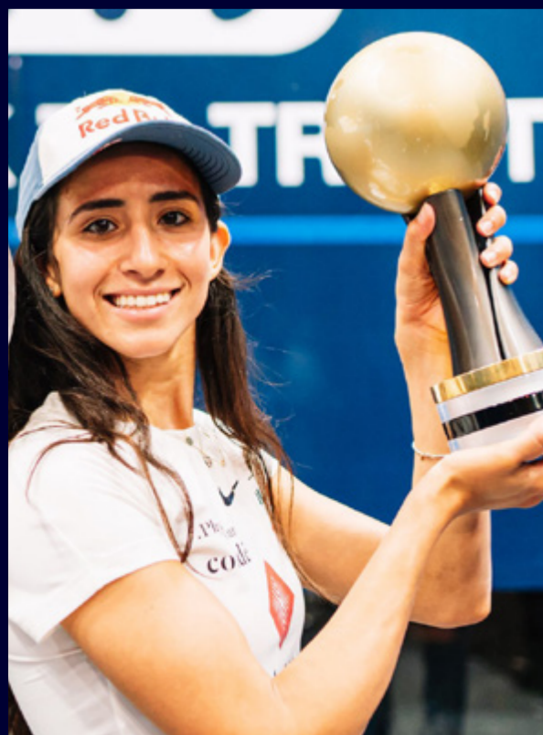
2024 NOURAN GOHAR Egypt

www.squashlibrary.info info@squashlibrary.info