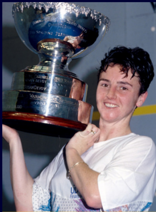
1985.1987.1990.1992 SUSAN DEVOY New Zealand