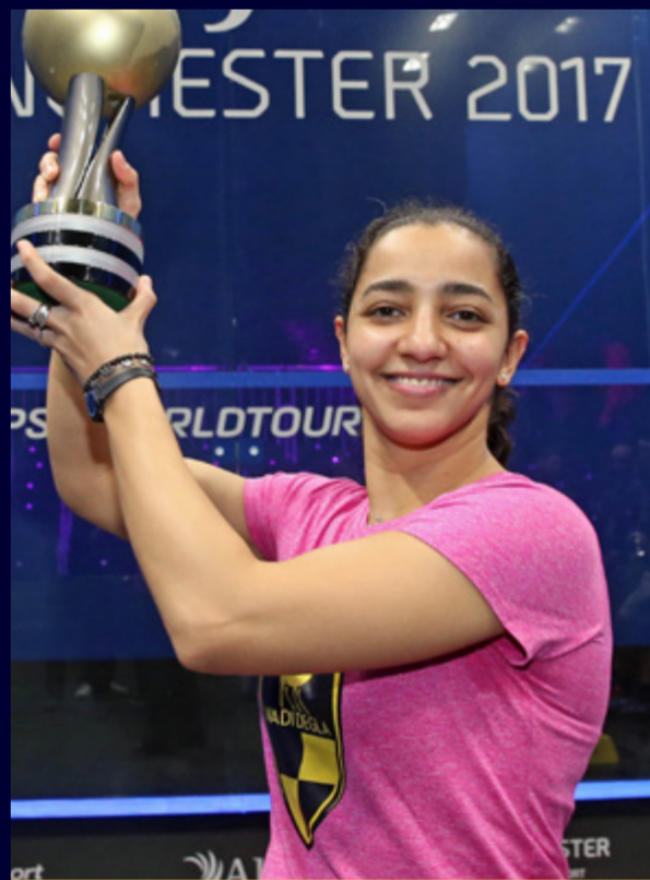
2017* RANEEM EL WELILY Egypt