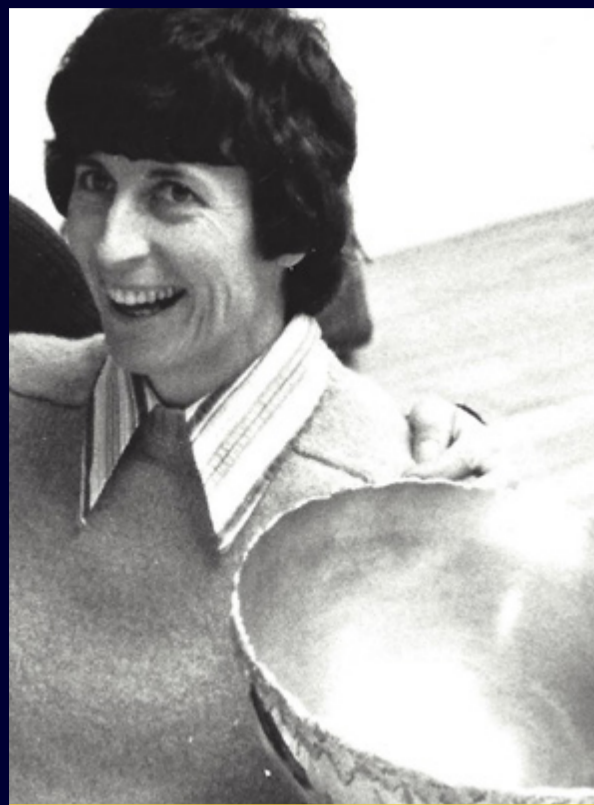
1976.1979 HEATHER MCKAY Australia