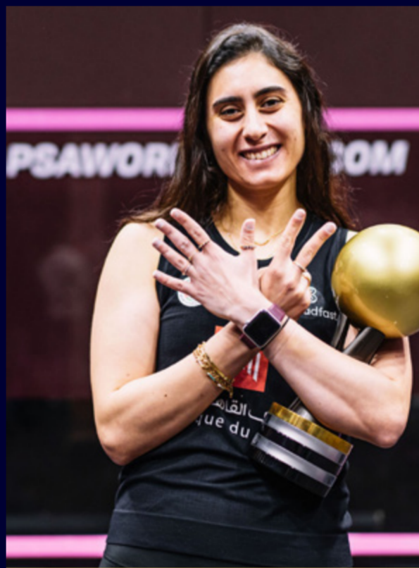
2016, 2017*, 2019*, 2019*, 2021, 2022, 2023 NOUR EL SHERBINI Egypt