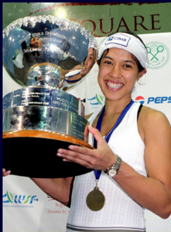
2005.2006.2008.2009.2010.2011.2012.2014* NICOL DAVID Malaysia