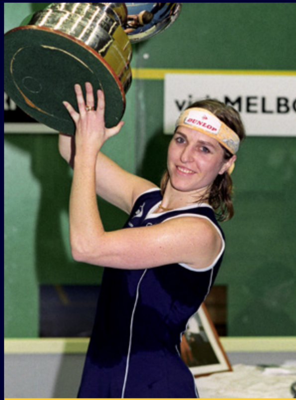
1996.1997.1998.2001.2002 SARAH FITZ-GERALD Australia